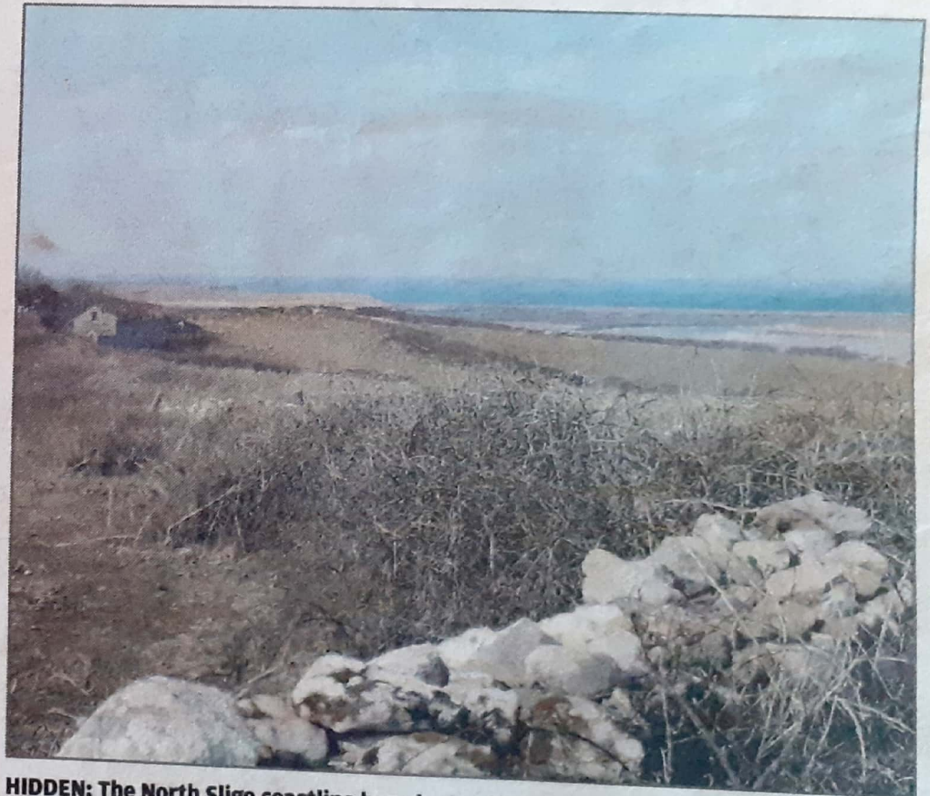
HIDDEN: The North Sligo coastline has plenty of hidden gems. This is the view from the back of Dernish.

To book and to discuss riding ability, call Ursula on 071-9166156 or email islandviewridingstables@gmail.com or